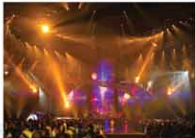
Eurovision 2007 - Finland