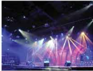
Crystal Casino - Russia