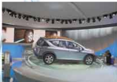
Geneva International Motor Show

This eagerly awaited fixture completes Robe's AT line of moving heads. A completely new optical system makes this fixture 50% brighter than its predecessor, the Wash 250 XT. New ultra smooth CMY colour mixing offers a fantastic spectrum of hues. A motorized zoom effect ranges from 8° - 32° and the extremely silent cooling system and movement make this fixture a superb choice for TV and theatre.